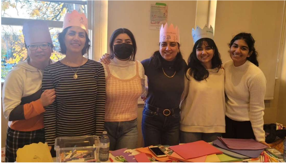
Edmonds Youth Group